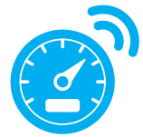
Smart HVAC Controls