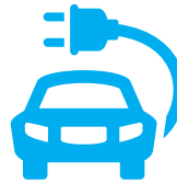
Managed EV Charging

Factsheets are available for other building types and for specific regions across the US. Multifamily buildings can save costs, reduce carbon emissions, and help advance energy system decarbonization through time-of-use energy efficiency, smart devices, connected controls, and distributed energy resources such as onsite/community solar and energy storage. The recommendations in this factsheet are based on a wide variety of research, including building-scale and grid-scale simulation modeling and on-the-ground GridOptimal pilot project experience.