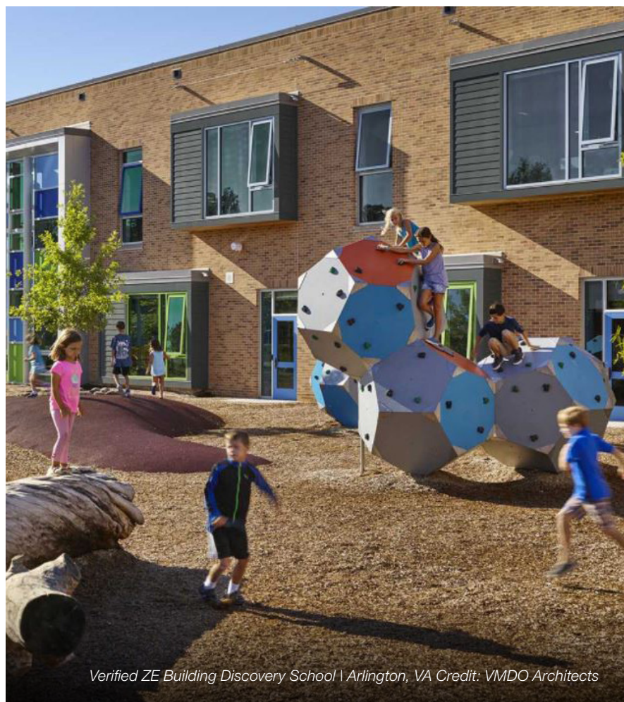
Verified ZE Building Discovery School | Arlington, VA

We know there are more projects than we have captured here. We encourage you to submit zero energy and ultra-low projects through our registry so we can recognize these leaders in the growing field of zero energy buildings.