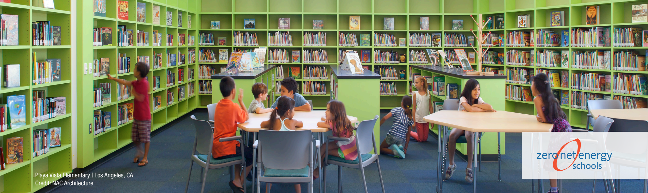
Playa Vista Elementary | Los Angeles, CA Credit: NAC Architecture