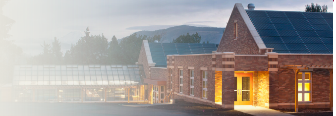
Image: Hood River Middle School | Hood River OR