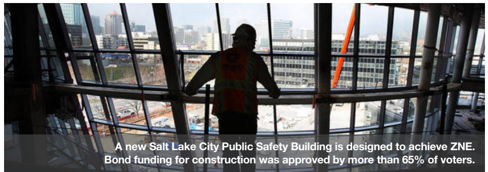
A new Salt Lake City Public Safety Building is designed to achieve ZNE. Bond funding for construction was approved by more than 65% of voters.