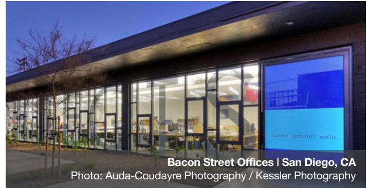
Bacon Street Offices | San Diego, CA

For example, construction costs at Turkey Foot Middle School in Edgewood, Kentucky, were $204 per square foot compared to the national median of $216 per square foot for new school construction.